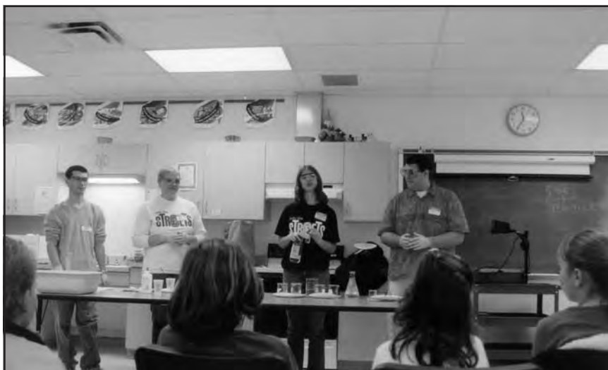
Over 600 Elizabethtown College students take part in the “Into the Streets” service-learning project each October. Here, a group of College students teach “fun with science” to kids at Elizabethtown Area Middle School.